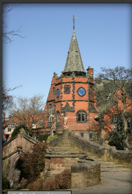
Dell Bridge and Lyceum