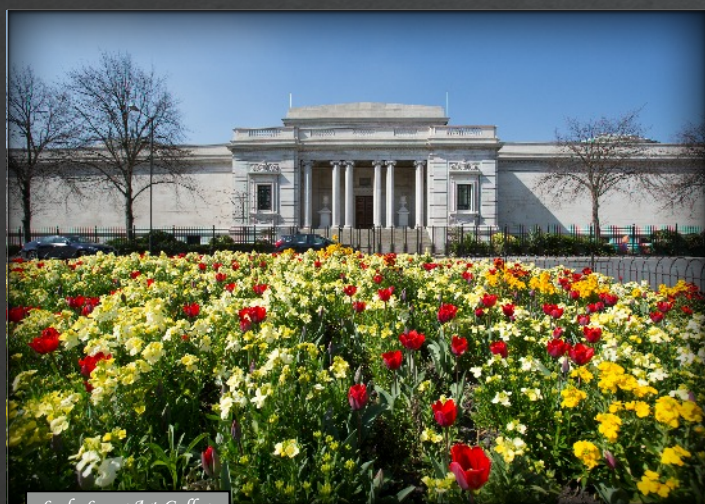
Lady Lever Art Gallery