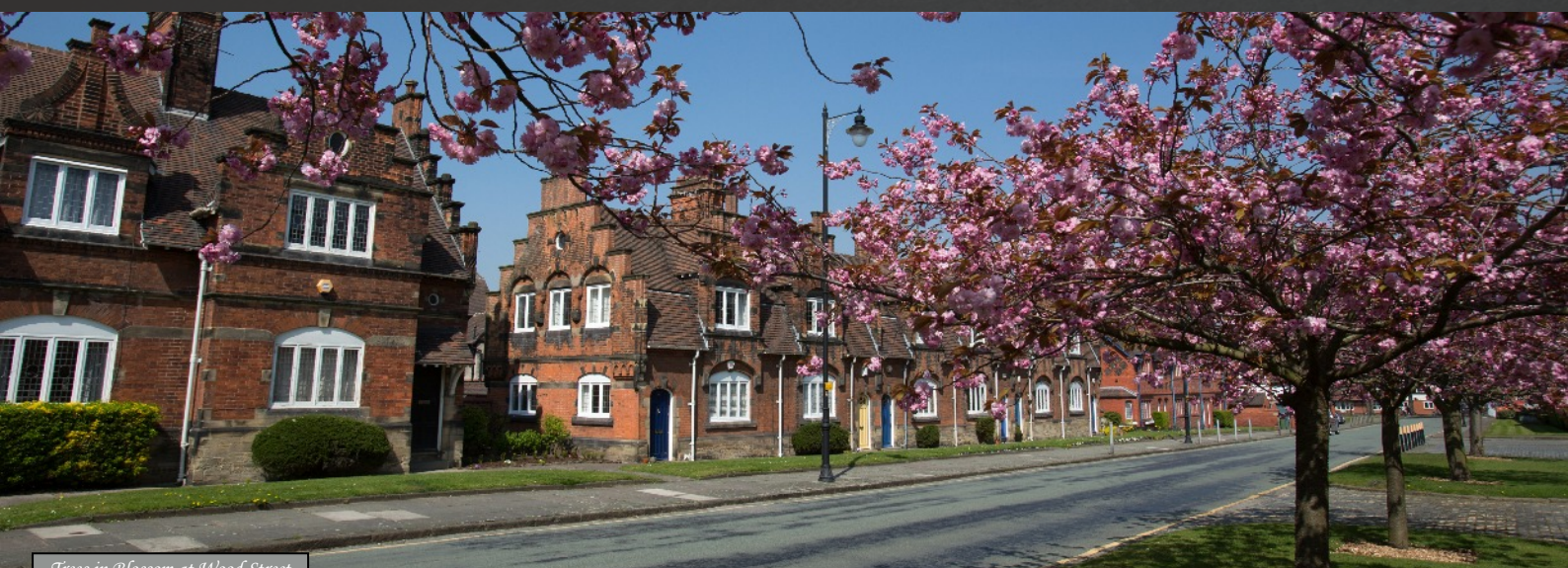
Trees in Blossom at Wood Street

Whether intentional or not, William wasn't just building a village for a workforce, he was conducting a social experiment and by doing so, creating a legacy which would outlive his industrial empire. Port Sunlight would provide a constant physical reminder over his and Elizabeth's positive contribution to much needed social reform. The village preserves the memory of William's philanthropy and entrepreneurial achievements, perhaps above and beyond that of other equally notable social pioneers of that period.