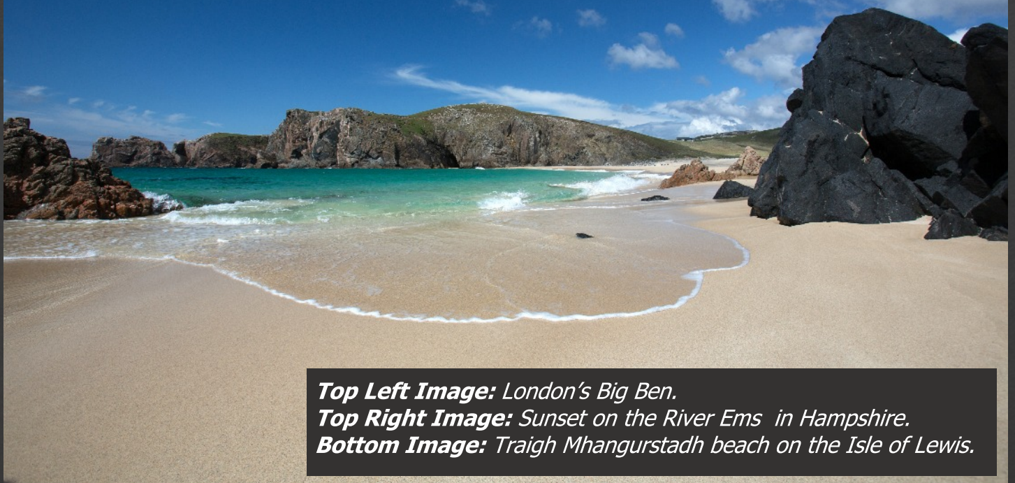
Top Left Image: London's Big Ben.